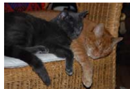
Sebastian (with new buddy)

Sebastian's new owner writes, "Sebastian is doing well since I adopted him. He loves my red cat. Not as good with my female cat. She has gotten very timid. Can't blame her, she's 14. He loves to play fetch with a ball. He'll even bring a ball over and drop it on your foot to start a game. He's really a nice cat."